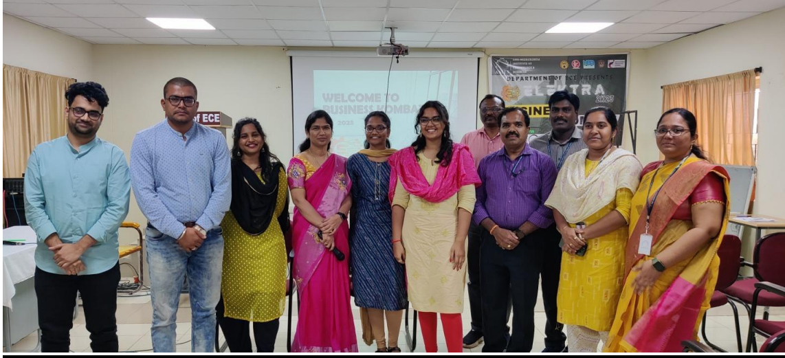
Winners of the business kombat event