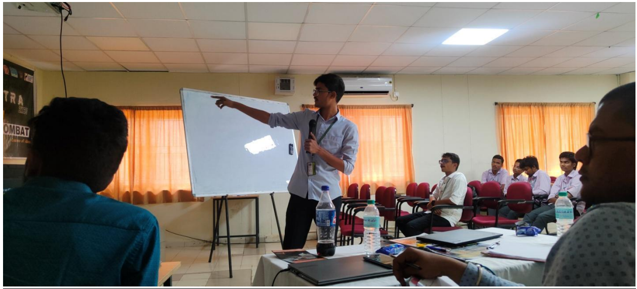
Students explaining their start-up ideas to jury members