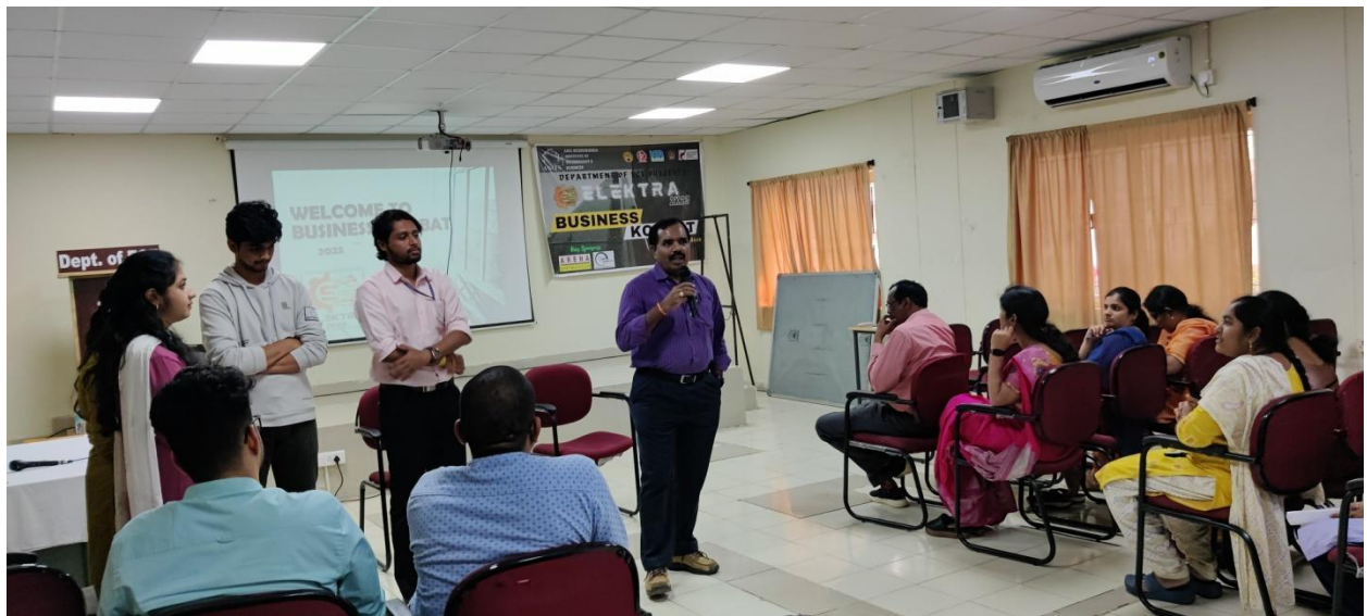
HOD/Head-Academics Address the gathering